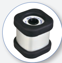
SV 36 Class 1 Acoustic Calibrator 94 dB / 114 dB at 1 kHz