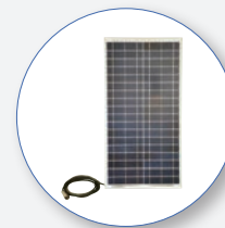
SB 276 Solar Panel to Monitoring Station