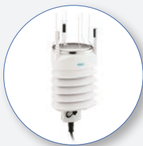
SP 275 Weather Station based on VAISALA module